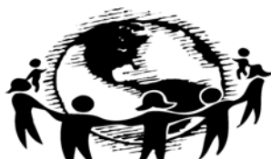
God’s World . . . Our Hands

If you need to warm up or defrost small amounts of food, use a microwave instead of the stove to save energy. Microwave ovens consume around 50 percent less energy than conventional ovens. For large meals, however, the stove is usually more efficient. In the summer, using a microwave causes less heat in the kitchen, which can save money on air conditioning. Adapted from http://www.energyquest.ca.gov/saving_energy/index.html